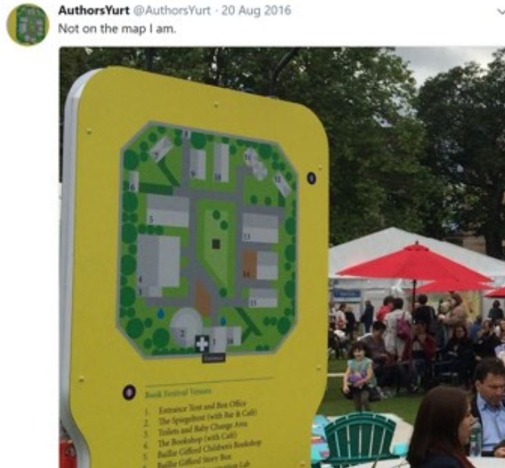
Figure 5: @AuthorsYurt notes it is not on the map.

Some authors enthusiastically embraced the possibility of having an online conversation with @AuthorsYurt, taking advantage of Twitter’s interactivity. A.L. Kennedy, whose observations in On Writing we referred to earlier, seemed particularly taken with @AuthorsYurt, comparing its turns-of-phrase to Yoda’s, and sending a series of cheeky tweets. Adding to the humour, a second Authors Yurt account was set up (by person or persons unknown to us), then a third joined the fray, flirting with horse gifs and the lure of the Mongolian plains. The original @AuthorsYurt took the opportunity to satirize the quantification tendency of creative industries discourse, by counting the number of Authors’ Yurt accounts. In response to a journalist’s tweet that reported festival “ticket sales up 3.5% and more than 62,000 books sold this year,” @AuthorsYurt tweeted, “Also, talking yurts 3 from 0 up.” 42