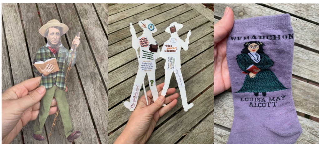
Figure 8: Literary tourism: Transcendentalist paper doll cards and socks.

In the era of late capitalism, cultural tourism, Etsy, and quirky merchandising, it is not very surprising to come across dolls made to resemble literary figures. Fans of writers can buy such products as an expression of their enthusiasm, just as they may buy other literary merchandise, or undertake pilgrimages to literary sites and writers’ houses. 46 On a tour of Massachusetts writers’ houses in 2019, for example, we bought paper doll cards of Ralph Waldo Emerson and Henry David Thoreau, adorning them with quotable stickers. We also bought socks that feature a doll-like image of Louisa May Alcott under the slogan “We March On” (see Figure 8).