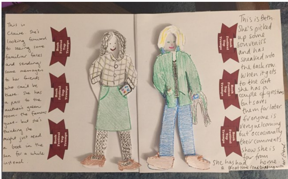
Figure 11: Paper dolls: Claire and Beth.

At a certain point in the creation of these six characters, one of us became uncomfortable with the objectification and simplification that our paper doll experiment involved, and demanded that we make paper dolls of ourselves as well. We made dolls of each other (Figure 11), a process which required a lot of trust (“Don’t make me look hideous!”) and pre-emptive forgiveness (“I’m sorry I’m so bad at drawing!”).