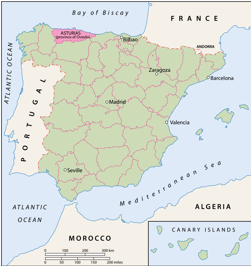
Map 1. The provincial division of Spain (map drawn by Cox Cartographic Ltd).