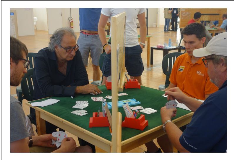
Figure 3. Two of the interviewees in partnership together: US players and world champions, Zia Mahmood and Jeff Meckstroth at the table. A partition or screen across the table is only used in high-level play to avoid facial expressions of partner being read. (Photo by Samantha Punch from the Open European Championship in Montecatini, Italy.)

At the bridge table, in order for dramaturgical loyalty to be carried out, it is vitally important that your bridge team-mates have dramaturgical discipline. This is evidenced through the performer appearing wholly immersed in their various activities (see Figure 1) in what appears a ‘spontaneous, uncalculating way’ (Goffman, 1959: 210). However, while one is engaged in this spontaneous performance, one must also retain sufficient intellectual and emotional distance from your performance so as not to be entirely carried away by it. This brings us to dramaturgical circumspection. Loyalty and discipline is something that your team-mates display performatively to you as well as to the surrounding audience. It is to the surrounding audience that circumspection is required. Too large an audience and you will not be able to control the reactions to your play. The smaller the audience, the easier it is to control for reactions and read your audience as well as your team-mates properly. Time also places constraints on you and your team-mates’ capacity for successful circumspection. The longer a show, the more likely it is for players to get tired, distracted, and therefore fail to maintain the appropriate level of loyalty and discipline (Goffman, 1959: 212–222).