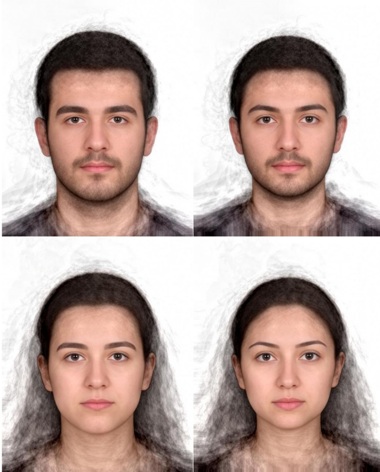
Fig. 1 Examples of the sexual dimorphism transform applied to male (top row) and female (bottom row) face prototypes. Masculinized versions are shown in the left column and feminized versions in the right column.

Forced-choice paradigms can produce qualitatively different patterns of results to other methods for assessing perceptions of faces (Jones and Jaeger 2019). We used the forced choice method in the current study to allow our results to be directly compared with previous research investigating putative links between self-rated attractiveness and face preferences.