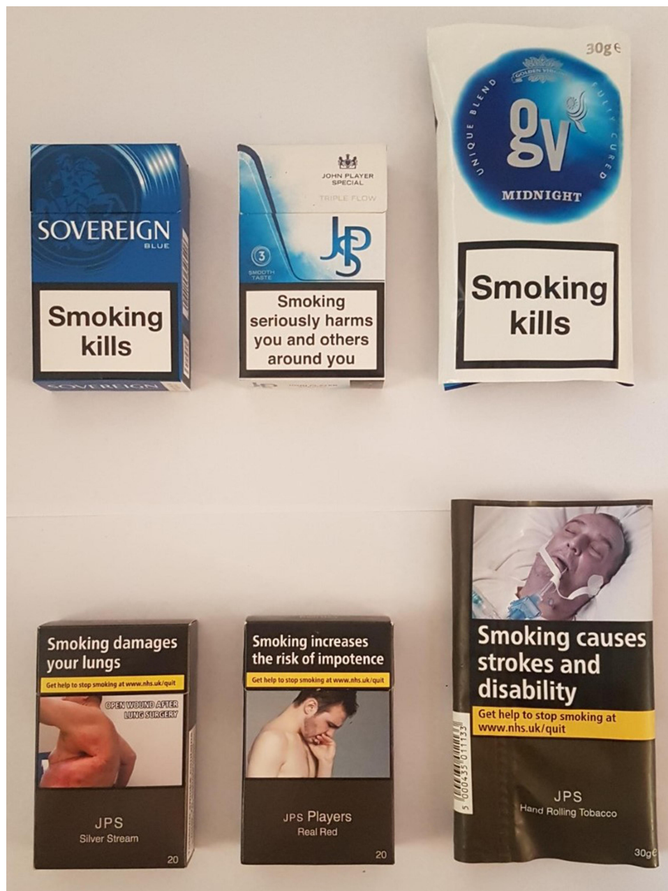
Figure 1 Examples of flip-top cigarette packs and rolling tobacco pouches pre-standardized packaging (top row) and post-standardized packaging (bottom row).

2020 for the second 16 ). Academic topic experts were also contacted.