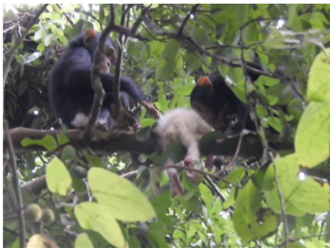
FIGURE 1 The dead body of the infant with albinism inspected by two infants, MZ and OZ, stroking its back and sniffing it, respectively.

At 7:54 a.m., FK approached the carcass again, picked it up, and moved 4 m away holding it by the foot. He bit part of the palm of the right hand of the carcass and immediately spat it out. MZ and OZ again approached the carcass to sniff it. At 8:09 a.m., FK placed the carcass in a tree branch and after grooming its back, moved around 7 m away to rest. At 8:25 a.m., ZL approached the dead infant, sniffed it, touched its penis and anus. ZL then inserted a digit into the anus of the carcass, moving the digit in and out before sniffing it. After 10 min of repeated manipulations and inspections of the corpse, ZL moved away. At 8:36 a.m., ST approached the carcass and inspected it by sniffing and touching it. ST was joined by KZ who also inspected the carcass. Both ST and KZ inspected, sniffed, manipulated, touched, and groomed the carcass repeatedly for 8 min. Notably, at 8:42 a.m., KZ pinched some hair on the right arm of the carcass with his lips before doing the same on his own body. At 8:44 a.m.,