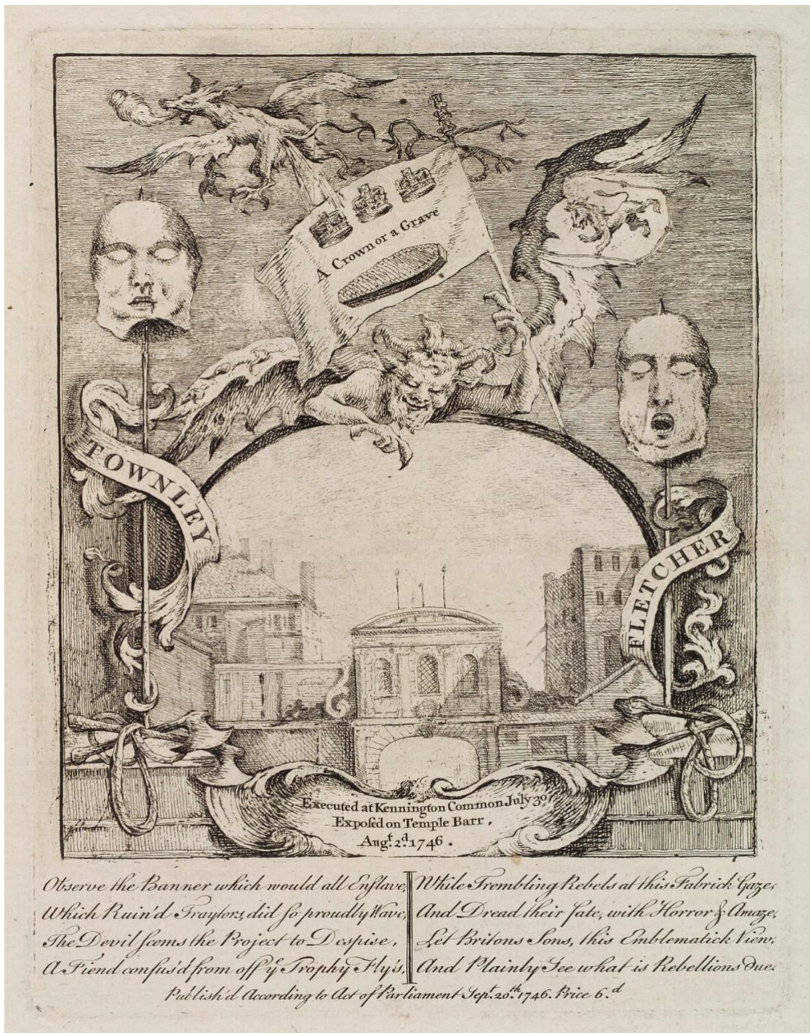
‘Francis Towneley; George Fletcher’ by an unknown artist, etching, published 20 September 1746 [NPG D20239]