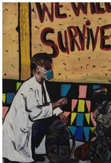
Figure 1. Painting 1 showing services changing to being provided on the streets.

The painting below (Figure 1) depicts the COVID-19-related changes to substance use/homelessness services and, in particular, the increase in outreach services.