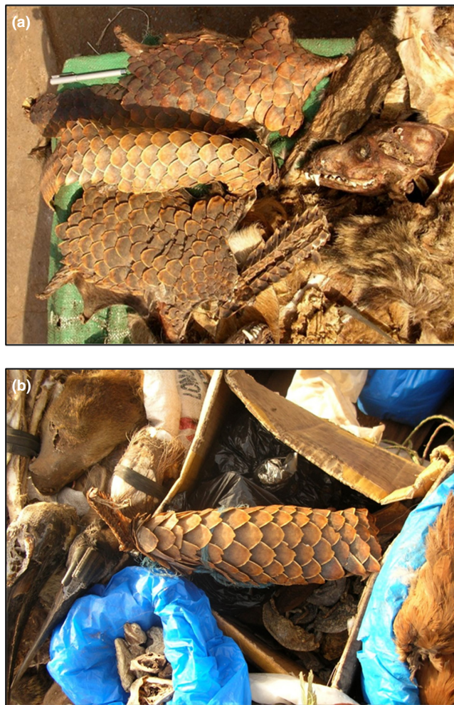
FIGURE 2 Black-bellied pangolin ( P. tetradactyla ) skins with scales for sale in the Marabagaw Yoro (fetish market), in Bamako, Mali. Three individuals supplied to the market by a traditional hunter from Kayes region on 11 March 2008 (a) and one individual on the market on 23 May 2008 (b).

animals at least once in their life (Warshall, 1989). West Africans and European and American tourists bought such products to acquire special 'powers' or as a sign of wealth and contributed to driving the trade in animal parts in Bamako. Several examples of how body parts are used to treat a variety of ailments or for ritual purposes are provided (e.g. hyena skin and python meat) and include selling stuffed pangolin paws to prevent rain (neither genus or species are reported). This was corroborated in 2007 by a traditional hunter based east of Bafing Faunal Reserve, who also stated that pangolin 'power' is the ability to control the weather (pers. comm. I. Edwards).