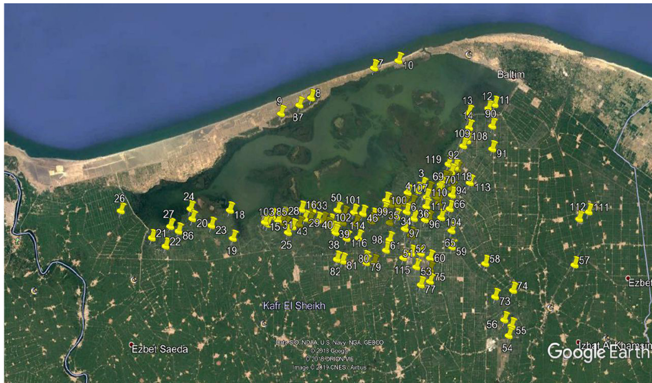
FIGURE 1 Locations of the Nile tilapia ( Oreochromis niloticus ) farms surveyed in Kafr El-Sheikh governorate, Egypt

University, Egypt (approval number: IAACUC-KSU-21-2018) and the University of Stirling's General University Ethics Panel (GUPE546).