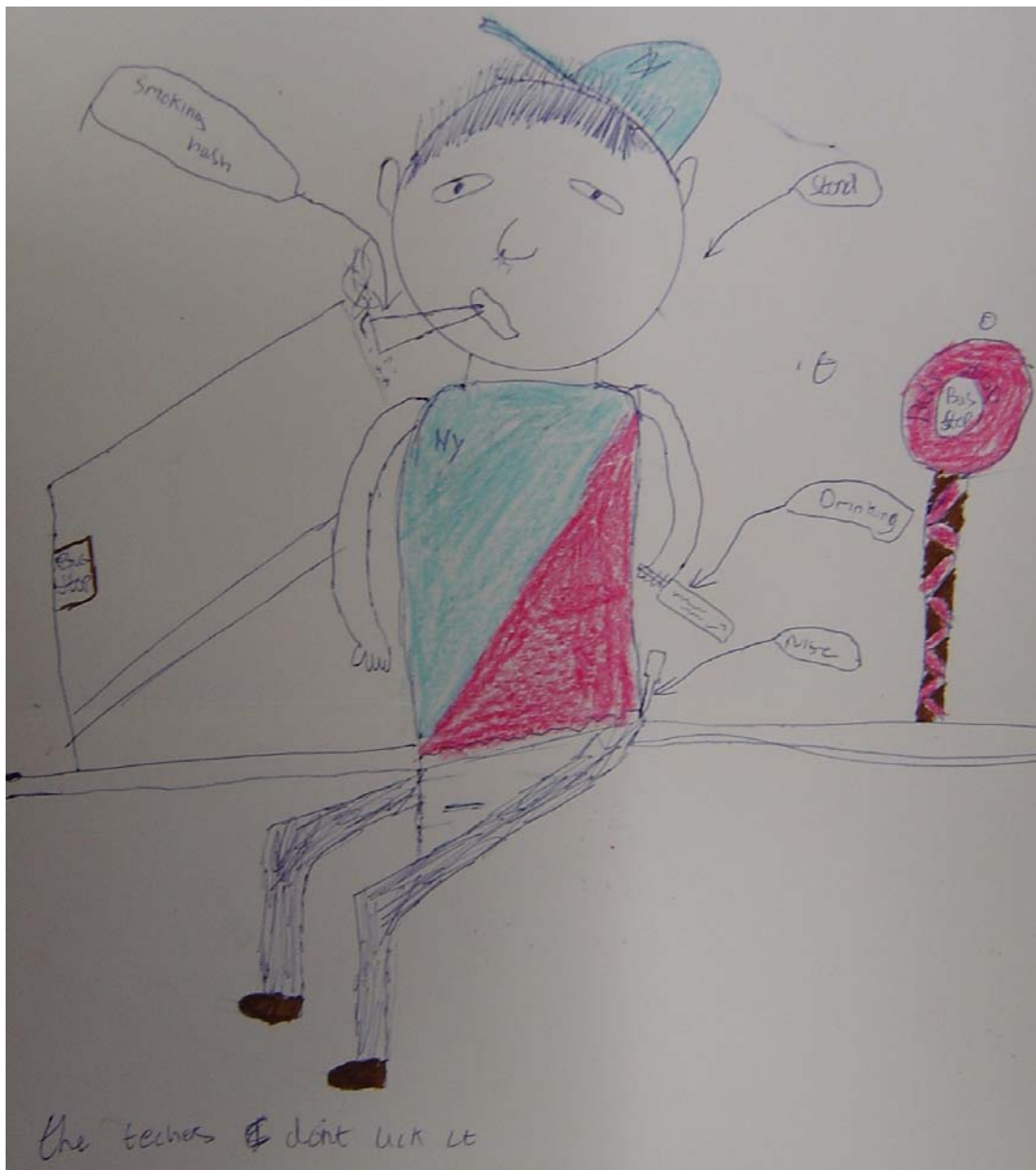
Figure: Drawing by Mark, YP2