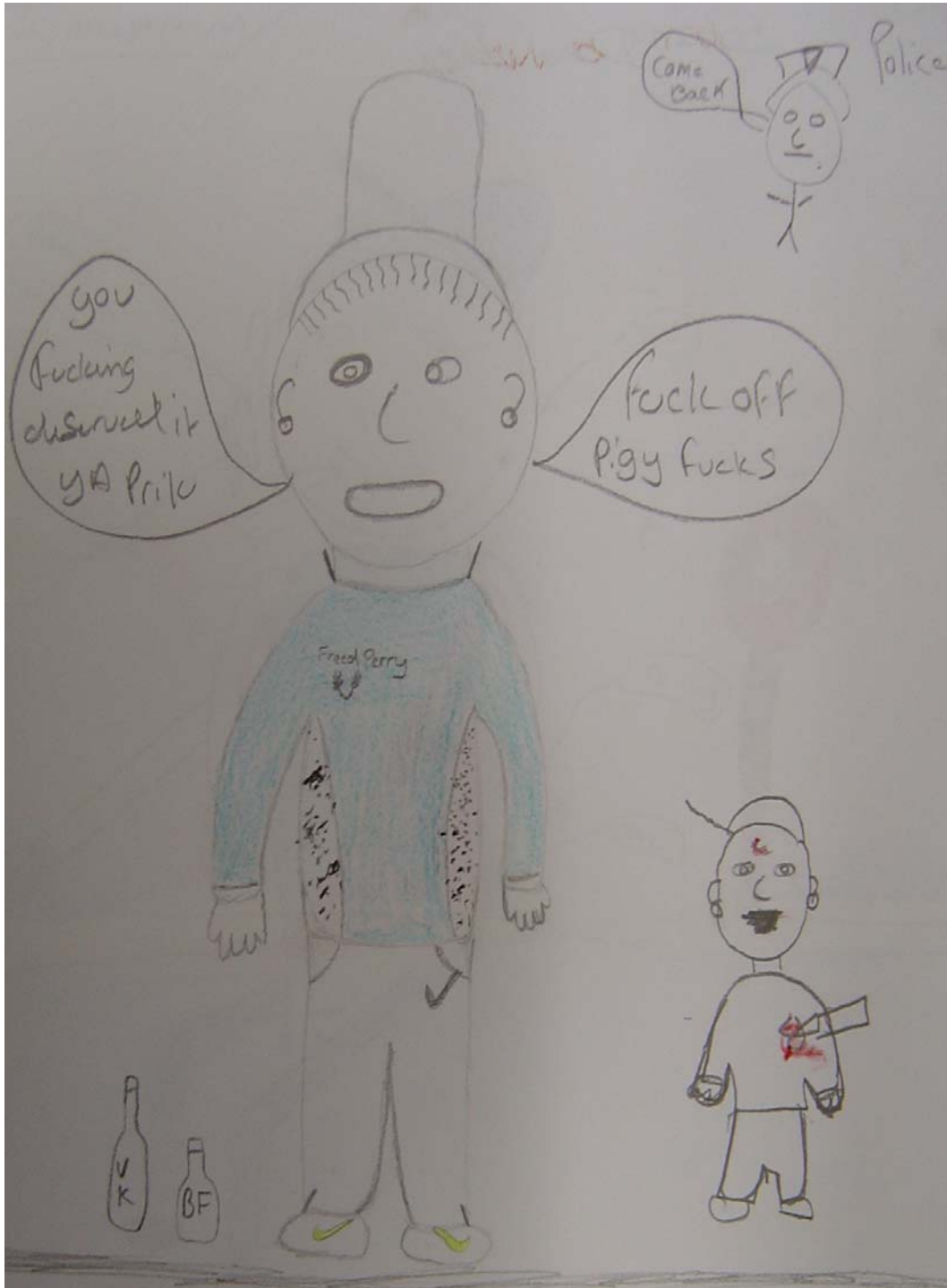
Figure: Drawing by Raul, YP2