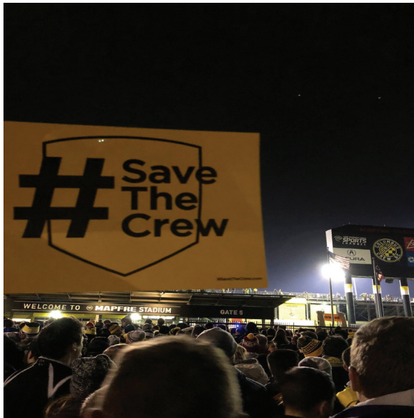
Figure 5. Crowds before a play-off game at the gate and struggling to get inside the stadium before kick-off.

The #SaveTheCrew folks have been saying PSV wasn't being truthful about this whole move. Now it comes out on court documents that PSV wasn't being truthful about this whole move. What else is necessary to get people to believe that the attendance figures aren't true, either?