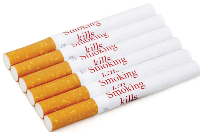
Figure 2. Warnings on individual cigarettes

existing and novel warnings on packs, and warnings on individual cigarettes. For the pack warnings, we created four novel warnings for India, drawn from the WHO Database 24-27 , with impact: 1) financial loss, 2) bad breath, 3) environmental harm, and 4) diabetes (Figure 1). These were tested against one of the current warnings, 'Tobacco causes cancer'. The warning on the paper of cigarette sticks was 'Smoking kills' (Figure 2), consistent with past research 14-23,28 .