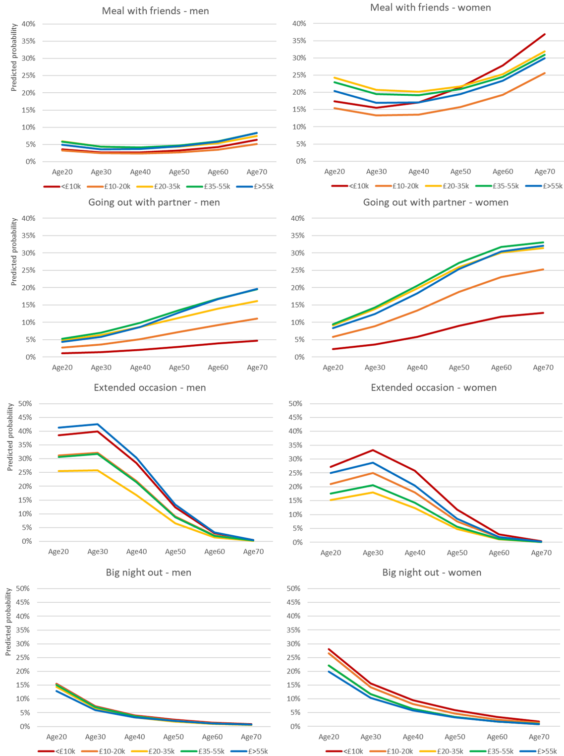
FIGURE 2 (Continued)

interpretation, write-up or the decision to publish. Use of this data is allowed under the terms of the contract and nondisclosure agreement between Kantar and the Universities of Sheffield and Glasgow, which requires