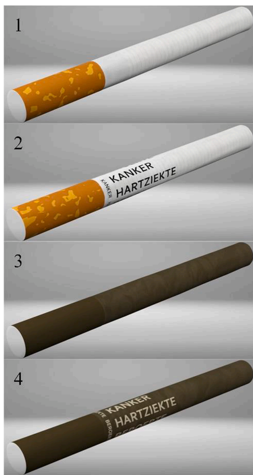
Fig. 2. Cigarettes used in second study, 1: a regular cigarette; 2: cancer, heart disease, stroke; 3: drab dark brown; 4: drab dark brown combined with ‘cancer, heart disease, stroke’.

certain’ (10) (Moodie et al., 2019; Juster, 1966). This is a relevant measure as most adolescents obtain cigarettes via their friends (van Dorsselaer et al., 2015), and this question is predictive of smoking initiation among adolescents (Morello et al., 2018).