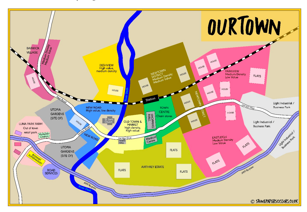
Figure 2. The map of 'Our Town'.

There is also a central map, which allows all the players to situate their houses within a fictional community (Figure 2).