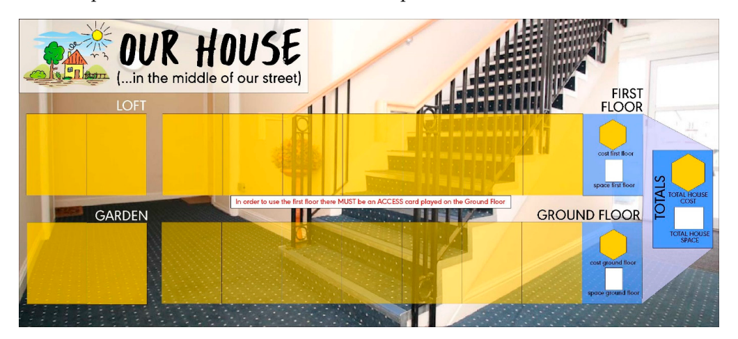
Figure 1. Our House, serious game board visual.

'Our House' is played in person, with people in groups of between 6–35. Although it can be played solo, players are usually grouped into pairs to encourage discussion and reflection on the decisions being made. The game provides players with a player mat (Figure 1) representing a house; a deck of cards representing rooms within a house; and a set of adaptation tokens that can be used to adapt houses.