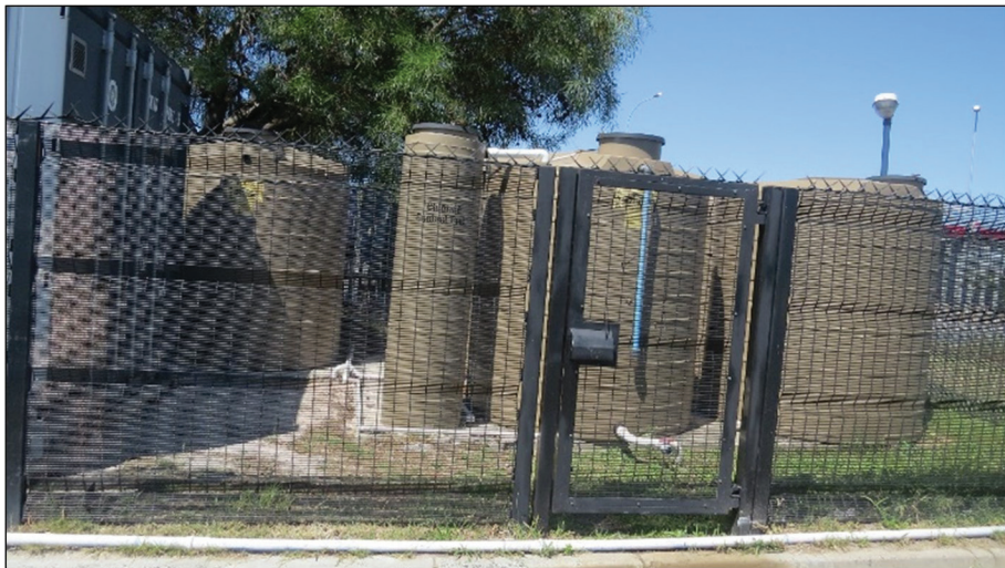
Figure 2: Clean water , by Bulelwa

Bulelwa’s caption for this image describes the use of boreholes: