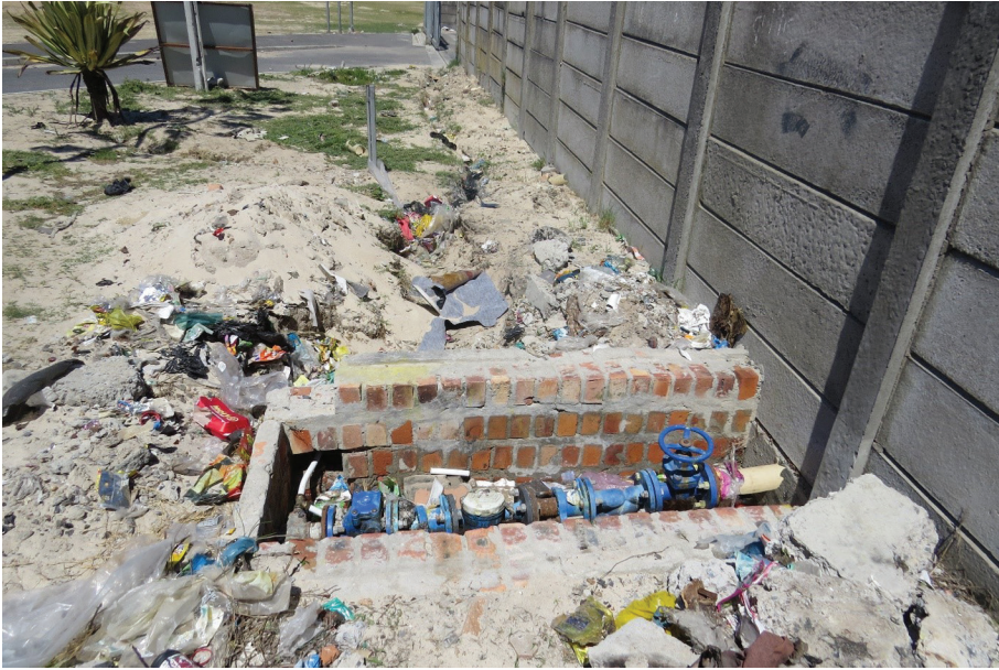
Figure 17: Voorbrug soccer field, Delft

This photo has been taken at a soccer field in Leiden, Delft. Here you can see a broken water pipe, and now there is an unstoppable supply of water. Thieves stole the pipes, to sell the copper and get a quick fix. We call them one-day millionaires – they have lots of money for one day, and the next day they are broke again. The water just keeps on running and running. This was reported by the security at the soccer field, but not fixed for couple of weeks.