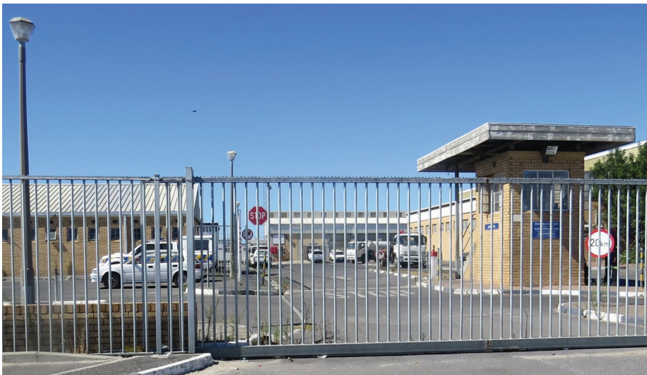
Figure 20: Municipality , by Logan

The image–text assemblages reveal a complex form of place-based learning that is neither as strengthening and affirming as the landscape pedagogies described by others (for example, Somerville, 2007; 2013; Johnson, 2012 ) nor as demanding and etiolating as those described in our previous study of nearby Sweet Home Farm ( Wilson et al, 2023 ). They also show how 'power dynamics and associated inequities are central to how water insecurities are lived and experienced' ( Rodina et al, 2024: 2 ). Our assemblage analysis approach, informed by a Deleuzo–Guattarian ontology ( Deleuze and Guattari, 1988; Deleuze, 1994 ), conceptualises Delft as a socio-material assemblage through which water flows, sometimes through well-regulated striations or along deeply etched lines of articulation, and sometimes uncontrolled, across smoother spaces and along lines of flight.