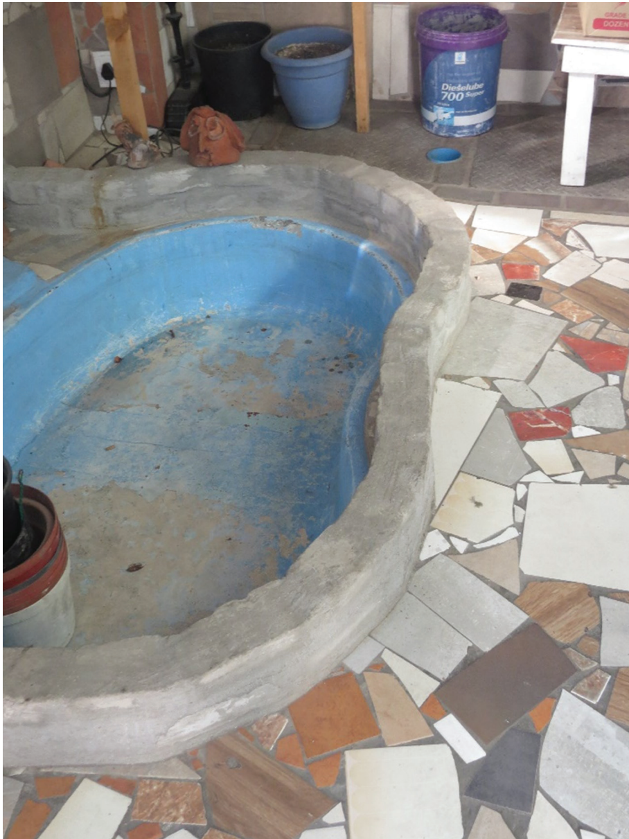
Figure 3: Fish , by Luthfiyah

Other photos show smaller containers, used by residents and households: buckets, bottles, tubs and even a fishpond, as in Figure 3 .