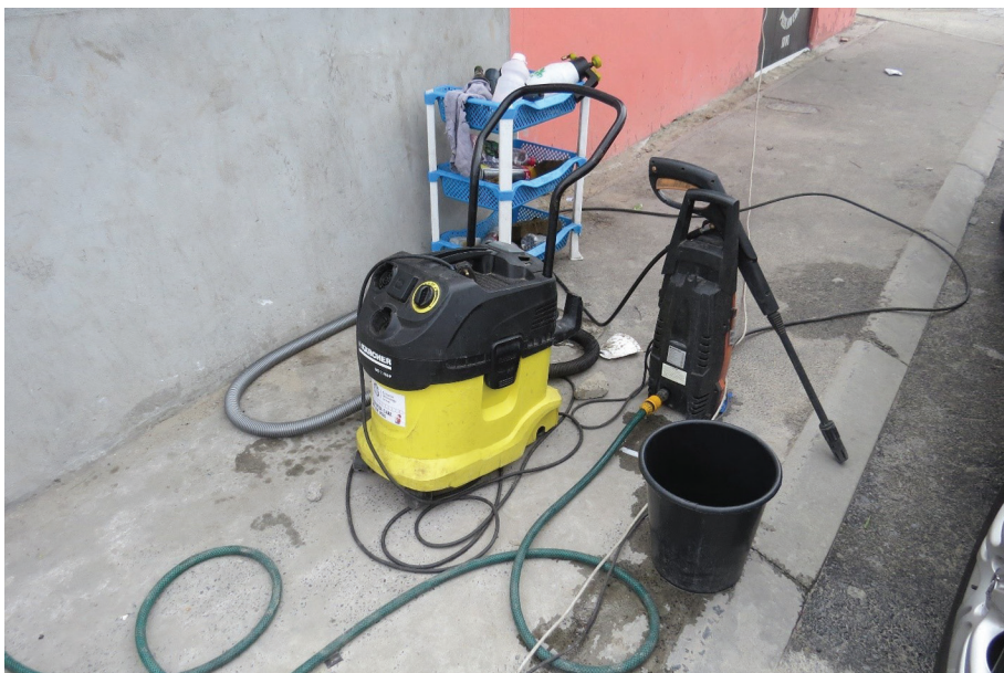
Figure 7: Car wash saving water, by Muneerah

garden with a sprinkler rather than a hose pipe. This ensures less water is used for the portion under cultivation 7 . Other images focus on efforts to reduce water used for washing cars, for example as illustrated in Figure 7 .