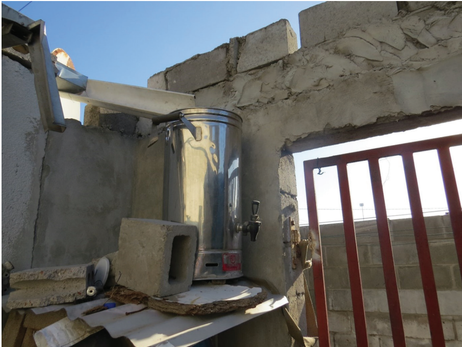
Figure 4: Urn capture , by Eloise

Eloise explains that this photo shows her own efforts to capture water: