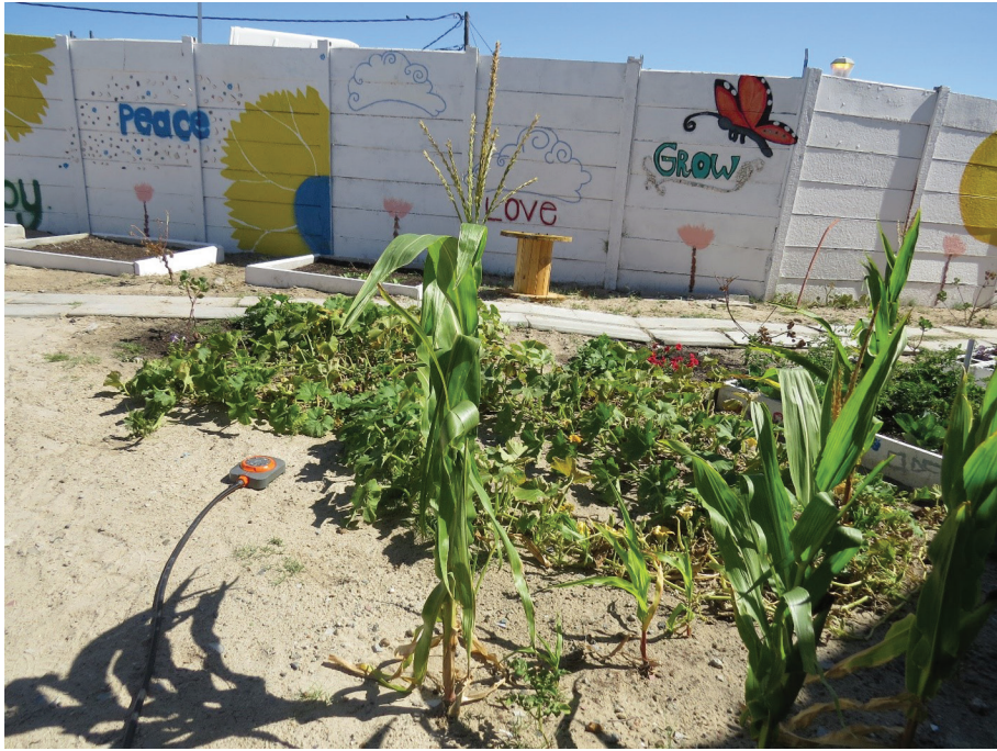
Figure 6: Garden at Roosendal High, by Soeraya

garden with a sprinkler rather than a hose pipe. This ensures less water is used for the portion under cultivation 7 . Other images focus on efforts to reduce water used for washing cars, for example as illustrated in Figure 7 .