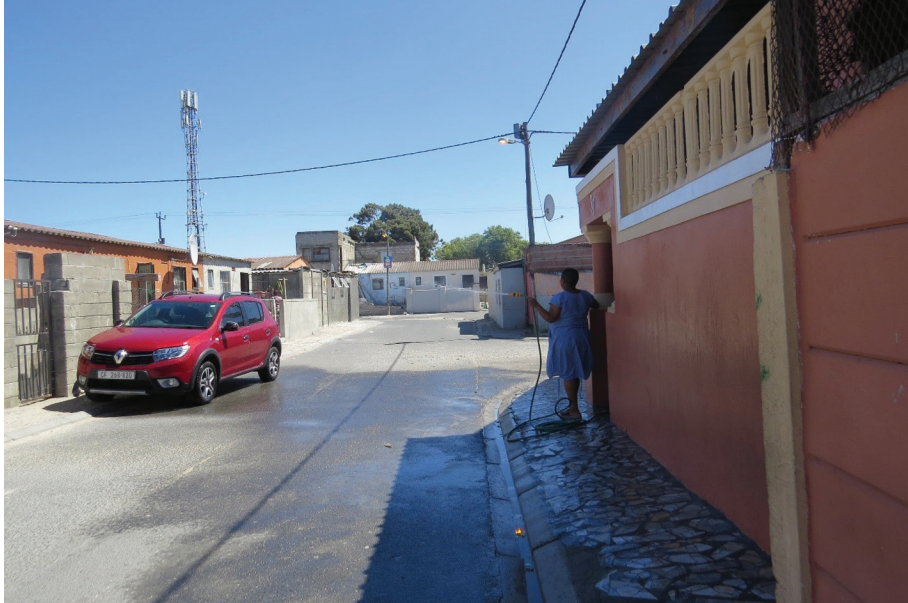
Figure 11: Washing the clothing , by Logan