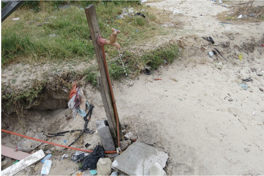
Figure 18: Running outside tap

As you can see, the buckets belong to the community in Covid [informal settlement]. The pipe is left unattended and the water is being wasted. Seems like nobody cares about saving water. I asked one of the ladies that were waiting in a queue for her turn to gather water. She said the tap was chopped last night by one of the tsotsis [gangsters] that lives nearby to sell it to the scrap yard.