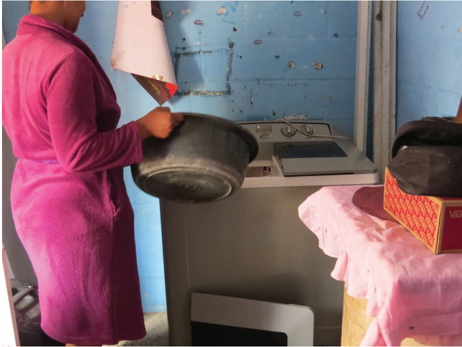
Figure 9: Rotation of water from the washing machine, by Frederich

Frederich describes the reuse practice here as follows: