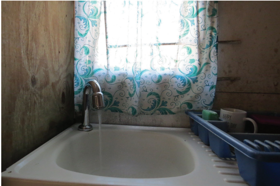
Figure 16: Leaking tap , by Logan

rubbish, so it overflowed. They were trying to close it with the large heavy stone, but it cracked the pipe and made the situation worse'. The continued loss of metered water costs residents money and so increases poverty, as Buhle explains: