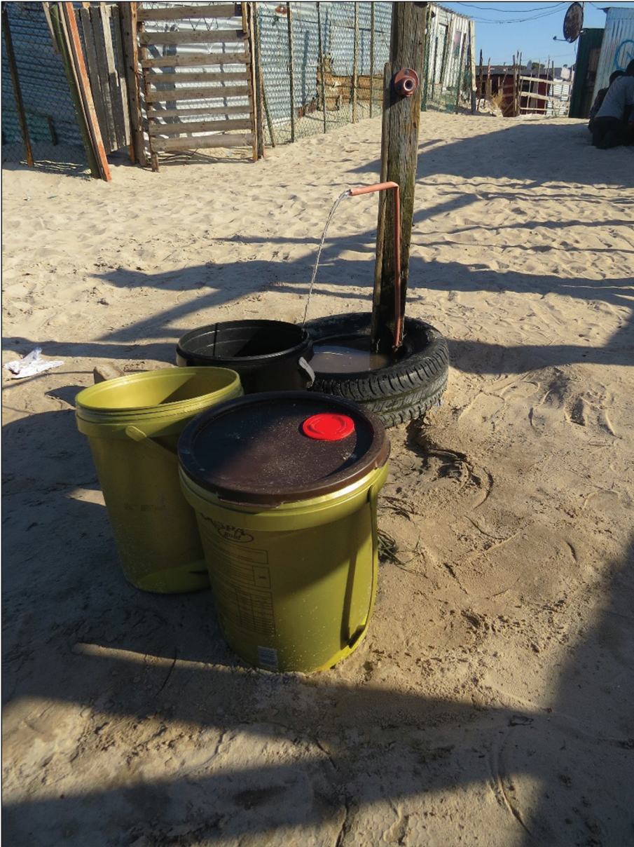
Figure 19: Chopped pipe , by Buhle

The school installed two Jojo Tanks and a working pump. This was used to water the grounds as well as provide greywater to the flushing of the toilets. The connection that provides a link between the tanks; pump and outside tap was stolen. The school then had to install a fence around the tanks and the water pump to ensure that it does not get stolen. If we want these type of systems to work especially in disadvantaged communities then we unfortunately also need to add in the security element.