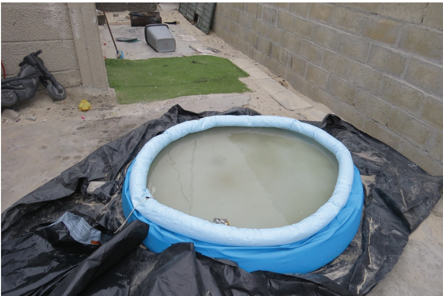
Figure 12: Pool wasting water , by Muneerah

Muneerah's caption acknowledges the hot weather but insists that the owner must find a way of saving water: