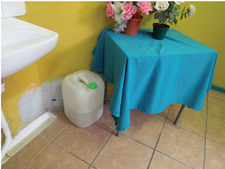
Figure 13: Potty posh , by Soeraya