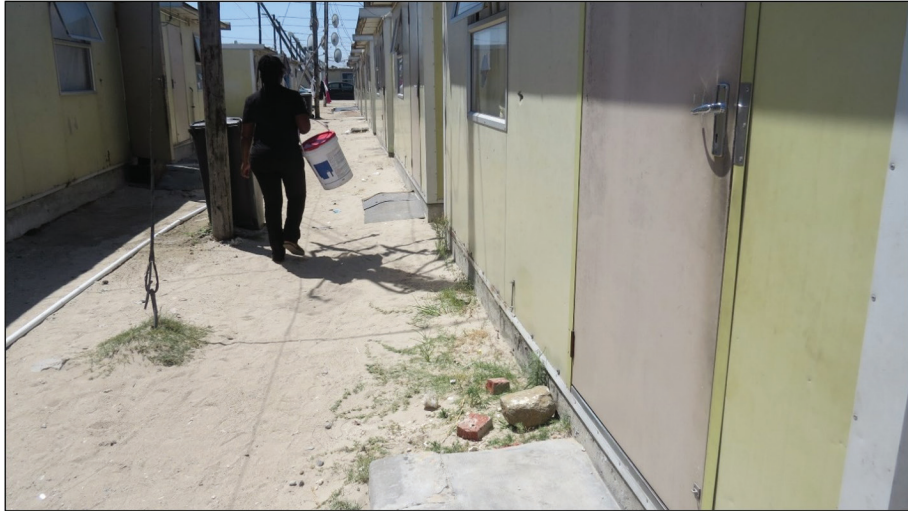
Figure 5: Fill up for washing , by Bulelwa

Bulelwa’s caption explains that the woman is using the bin next to her as well as the bucket: