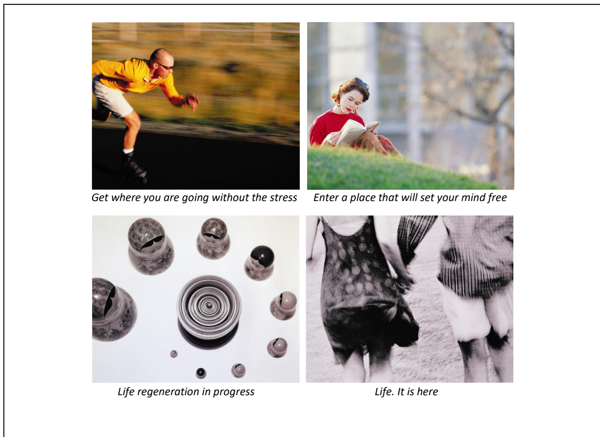
Table 1: Victoria Park marketing images and text