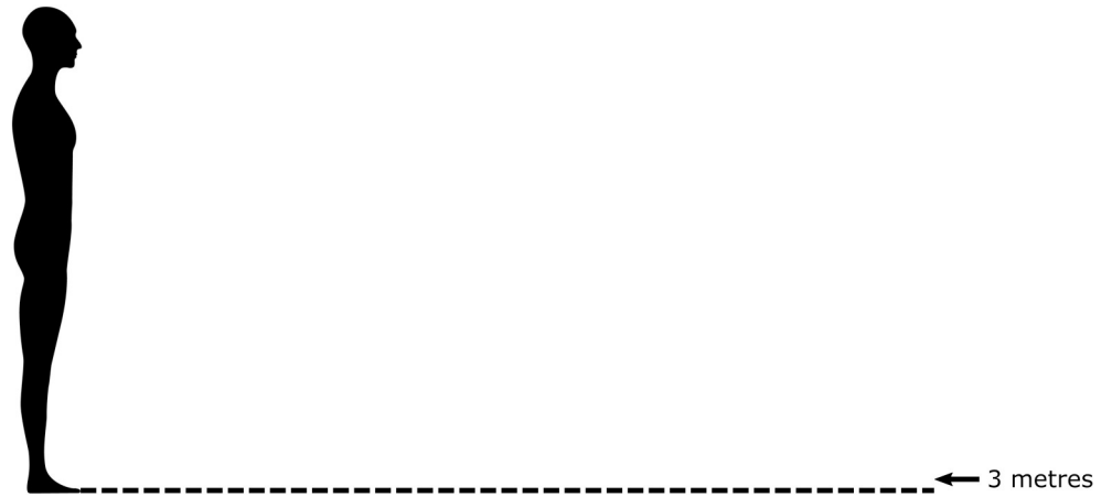
Fig 1. IPD rating scale. Participants were asked to indicate the smallest distance from the depicted person at which they would be comfortable, by clicking on the image.

https://doi.org/10.1371/journal.pone.0285202.g001